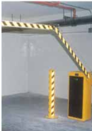
Car Park Gate control